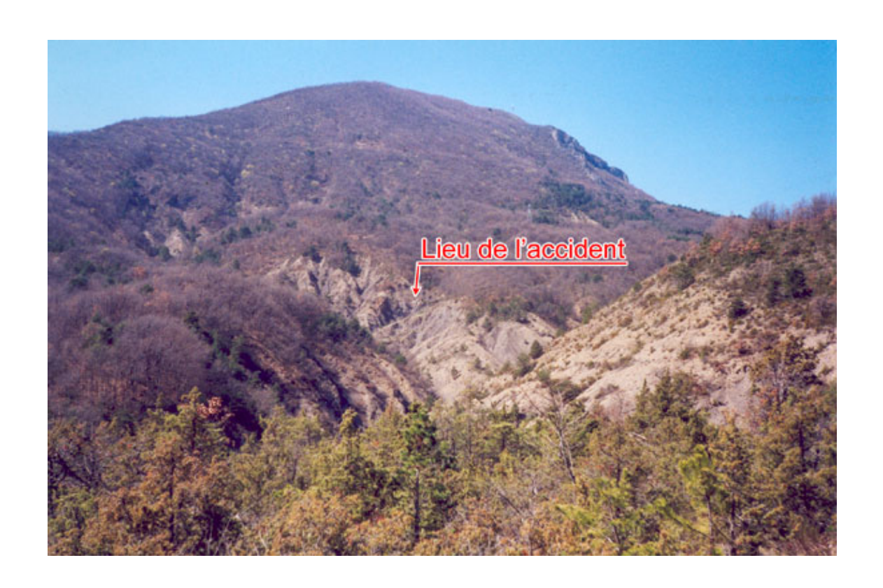
D-0585/D-3575 on 31 March 2002