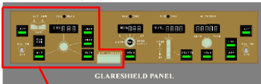
Representation of the Boeing 777-300ER MCP

The flight manual for the aircraft indicates (Section 1, page 13) that the autopilot must not be engaged under the minimum engagement altitude of 200 feet after takeoff.